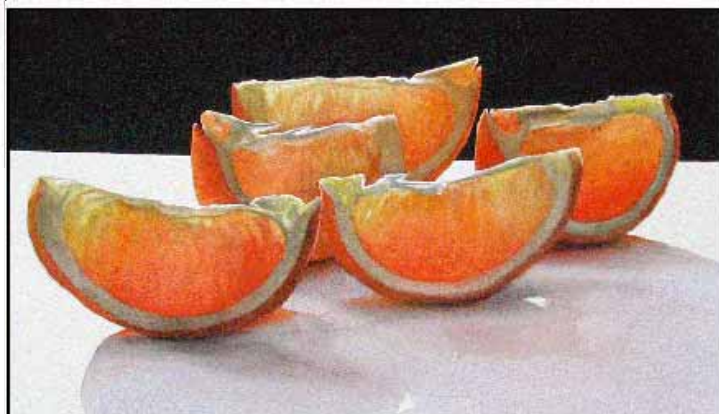
“Five Slices of Orange” — 17"x20"