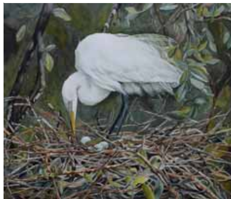
Tricia Love - "Nesting Time"