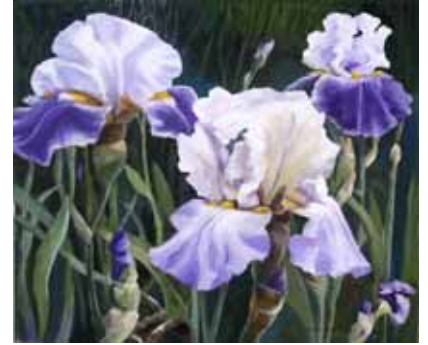
Depy Adams - "Purple Irises"