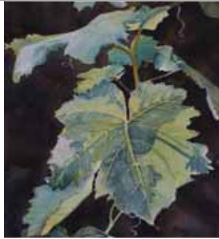
Jinkle Seagrave - "Mother of Merlot"