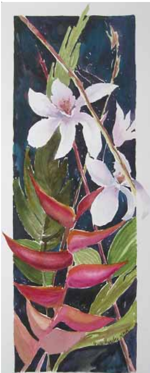
Laurel Weathersbee - "Front Porch Orchids"