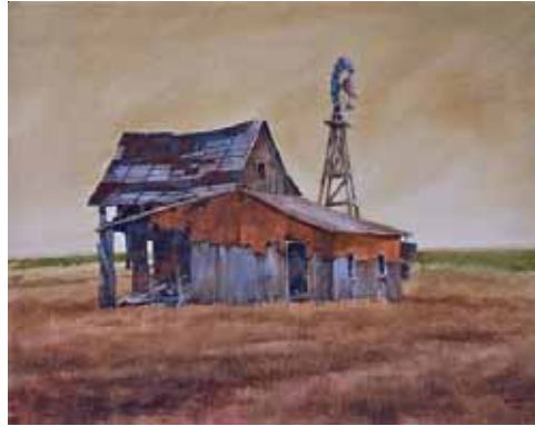
Bud Edmondson - "Dusty Skies"