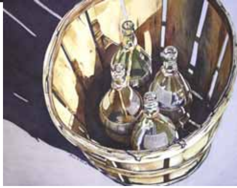
Tricia Love "Bottles in a Basket"