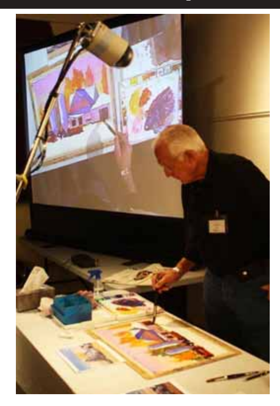
Carl Dalio Demonstration

While 'Color Power and Composition' was the nominal focus of the Carl Dalio Workshop, held Oct. 2, 3, 4, in the Fine Arts Gallery at EXPO NM, watercolorist attendees learned about so much more. At the Monday evening demo, in front of a full house, guests saw Mr. Dalio paint a fall farm scene, with buildings and silos, in vibrant color. Several viewers seemed a bit shaken by the boldness of the pigments used, but it all came together to form a pleasing whole. During the week's workshop lessons, students were asked to roll it back a bit, for reinforcement of fundamental lessons. Initially, using our charcoal vines, we drew images while only allowed to employ 2 values; a very dark tone or leaving the white of the paper. In the critique that followed. Mr. Dalio discussed the importance of visualizing shapes. proportions and connections between components of the drawings. The next exercise utilized a similar approach, with the addition of an intermediate value, which served to unify the composition and guide the eye throughout. One of his overarching principles was not to be a slave to a photograph, but to paint from the heart and with passion. Anything less is boring and inauthentic.