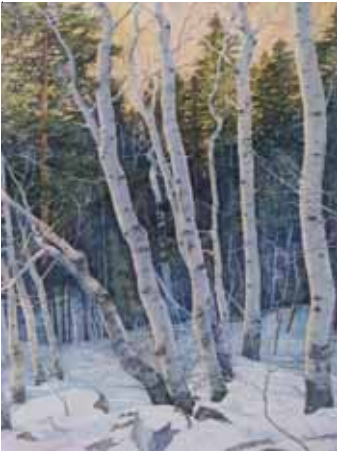
Kirby Roll - La Luz Trail Aspens