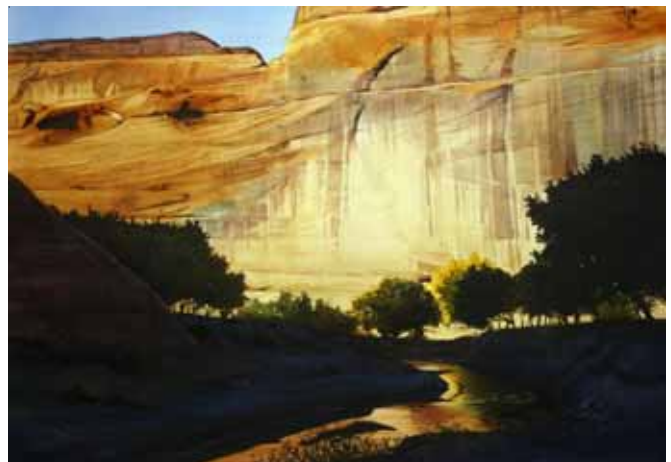
Robert Highsmith - Wall Reflected in Water