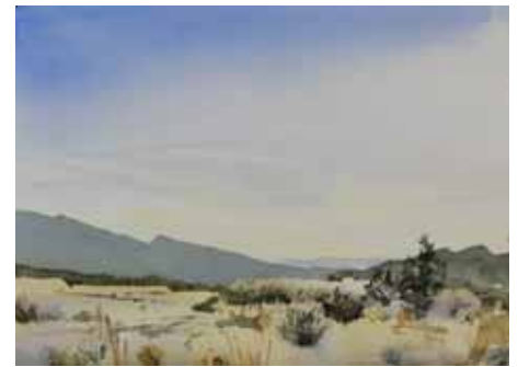
Katherine Gauntt - East View of Sandias