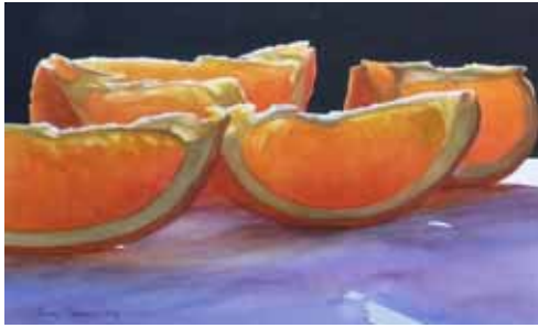
Penny Simpson - Five Slices of Orange