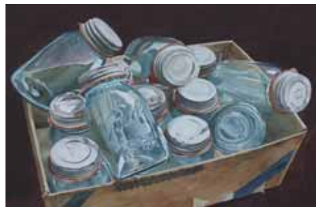
Trica Love - Perfect Masons