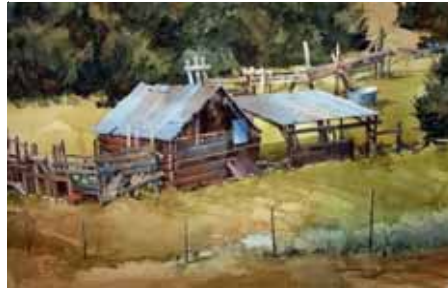
Bud Edmondson - Barn in Golden