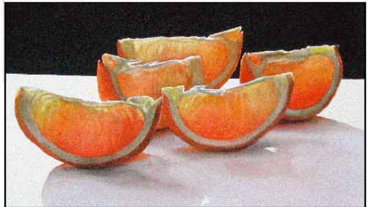
“Five Slices of Orange” — 17”x20”